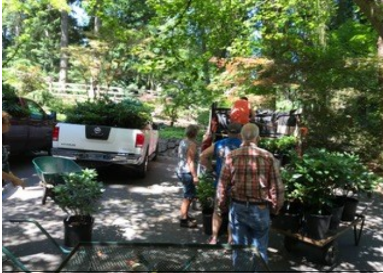
Looking to find room for one more cart load of rhodos.

Several in our group have experienced the trepidation we feel as we approach the border and wonder what will be our experience this time, as we try to import rhododendrons from the USA. We have attended conventions and conferences, visited nurseries, received plants from friends all in the name of rhododendrons and our passion for these plants. We have been stopped, our passports taken away, our vehicles searched, been interviewed for several hours, redirected to a different border crossing, been told we were a business, etc. With these experiences in mind, plus the fact that we are the recipients of Jim Barlup's remaining hybrids, I decided I would do "due diligence" and contact Ottawa so that there would be no further problems at the border. I used the Scout saying,